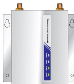
(1) Top View